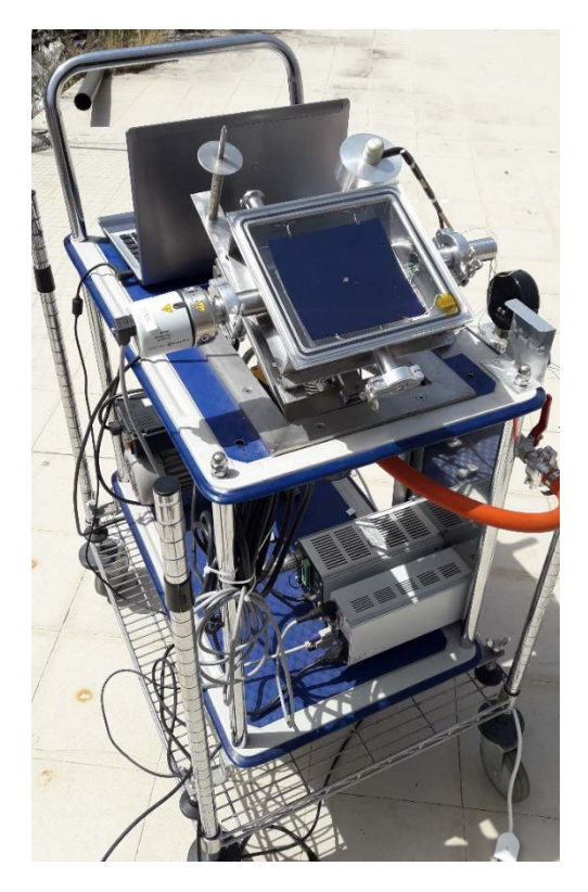
Figure 1 - Left: A Selective Solar Absorber is installed in the calorimetric device. Right: The calorimetric device during the outdoor testing procedure