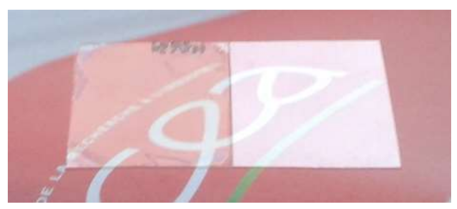
Figure 1 : Picture of polycarbonate substrate with moth-eye structure (on the left) and without any antireflective treatment (on the right) – Antireflective moth-eye structure improves transmission through PC substrate.