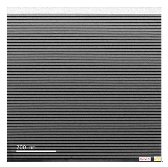
Fig. 1. Cross-sectional TEM image of the periodic Mo/Si bilayers by sputtering using cooling system.