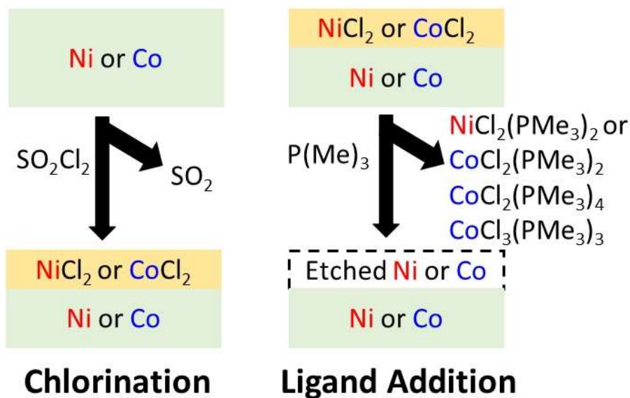
Figure 1. Schematic of thermal Ni and Co ALE surface chemistry based on sequential exposures to \text{SO}_2\text{Cl}_2 and \text{PMe}_3 .