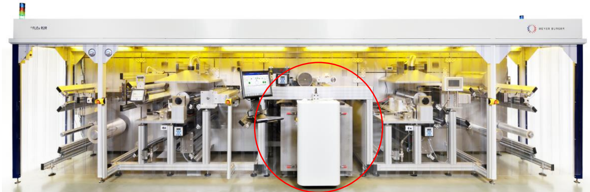
Figure 1: FLEx R2R sALD platform, with pre- and post sALD modules. Encircled is the sALD module.